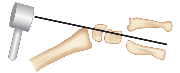
Fig. 2: Initial direction of entry of the K wire through the carpal bones into the intermetacarpal web space

The ideal position for wrist arthrodesis is not clear. Clayton recommended a neutral position with about 10° ulna deviation. Larsson, however, reported slight extension, and ulna deviation