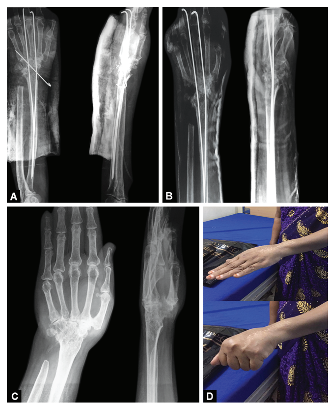
Figs 4A to D: (A) Immediate postoperative radiograph; (B) Follow-up radiograph at 6 weeks after removal of oblique wire; (C) Final follow-up radiograph at 2 years with complete fusion of radiocarpal joint; (D) Clinical outcome with good power grip function

increased the grip strength.<sup>15</sup> On the contrary, Hinds et al. said that the position of fusion did not affect the grip strength or satisfaction.<sup>11</sup> In our case, the position of the wrist could be changed by different degrees by bending the K wires after they had been introduced into the bone (Fig. 3). A similar technique was reported by Lee and Carroll.<sup>8</sup> They described the combination of an intramedullary Rush pin and an iliac crest bone graft. They used a 3/32 Rush pin instead of K wires.