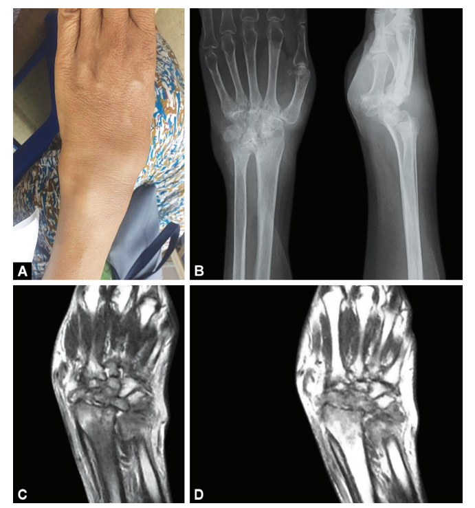
Figs 1A to D: (A) Clinical picture of the deformed wrist; (B) Preoperative radiograph; (C and D) MRI images with loss of signal intensity in the proximal row carpal bones